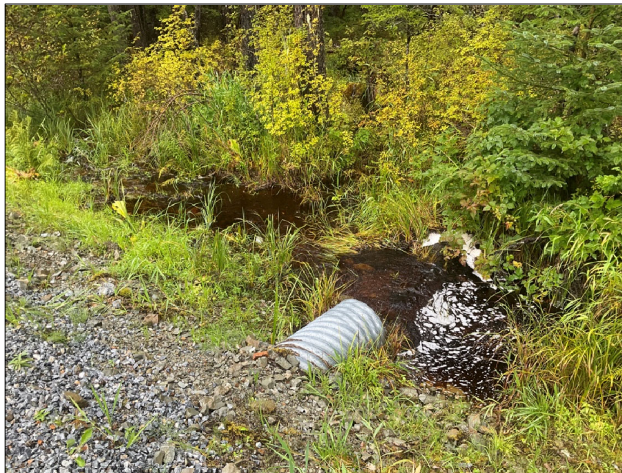
Figure 3.—Culvert outlet at waypoint 952.