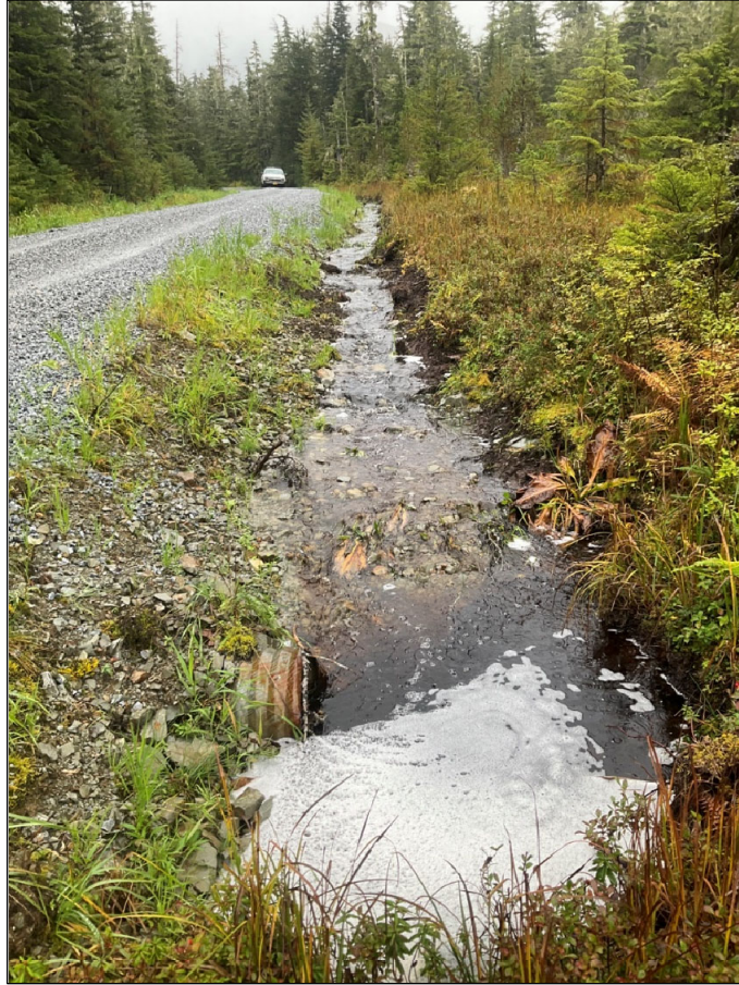
Figure 2.—Channel and culvert inlet at waypoint 952.