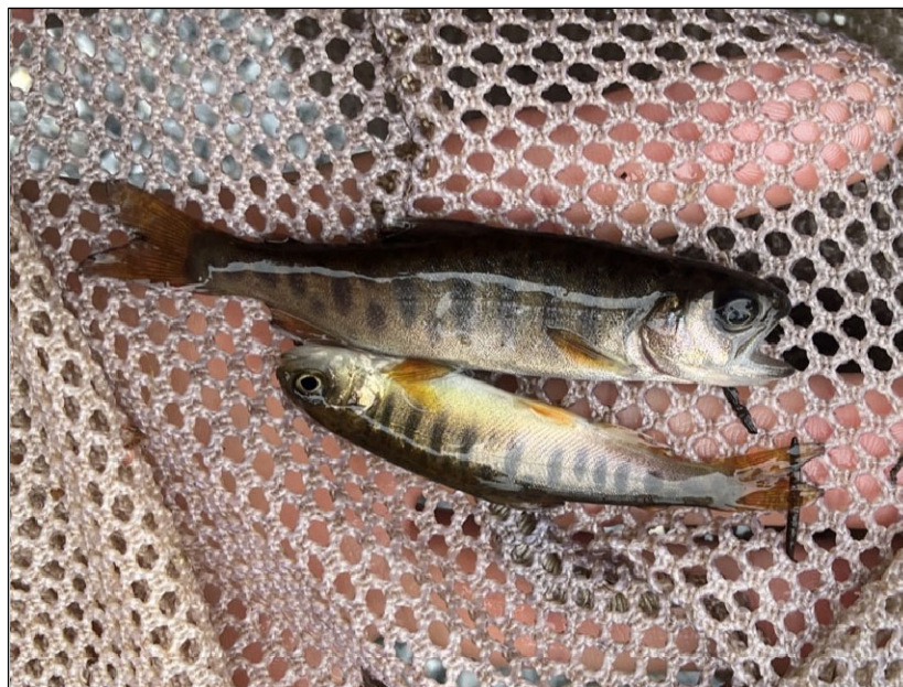
Figure 1.—Juvenile coho salmon captured at waypoint 951.